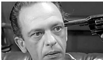
Their Shocking Final Words Before They Died Promoted By Viral Piranha