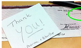
Forget Social Security. If You Own a Home, Do This! (It's Brilliant) Promoted By Live Smarter Journal